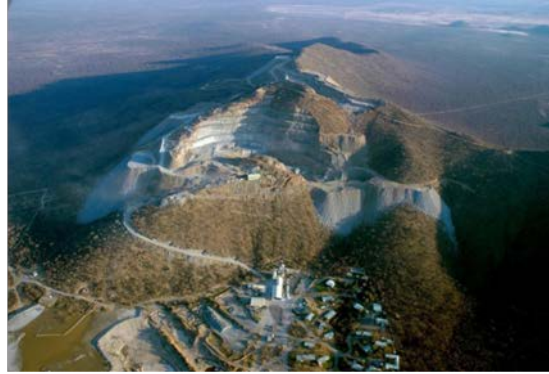
Gecko Namibia's Okorusu Mine